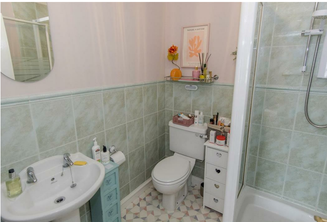
En-Suite 5'8" x 6'1" (1.73m x 1.85m)

Fitted with a low flush WC, wash hand basin and a corner shower cubicle with ceramic wall tiling.