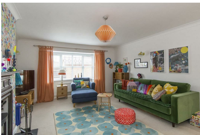
Lounge Diner 20'9" x 13'7" (6.32m x 4.14m)

This spacious room has a bay window to the front, a cast iron feature fireplace housing a log burning stove and coving to the ceiling.