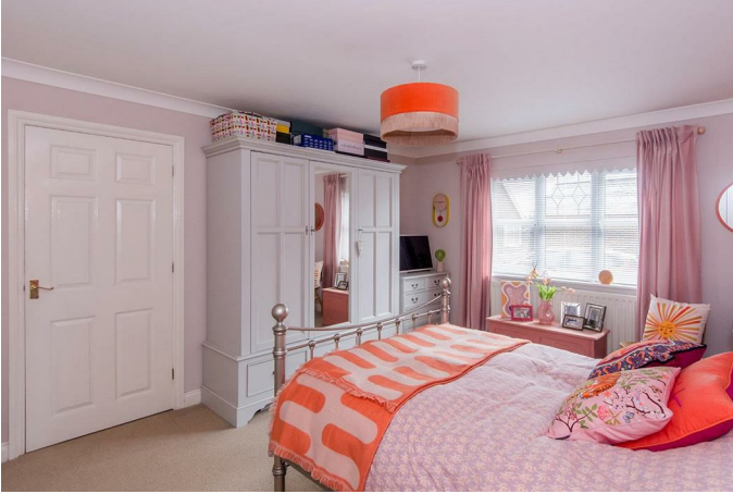
Bedroom One (Photo Two)