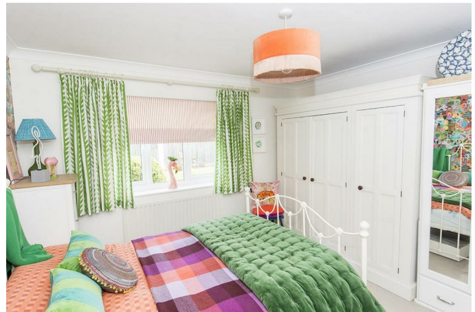
Bedroom ( Photo Two )

Fitted with a low flush WC, wash hand basin and a corner shower cubicle with ceramic wall tiling.