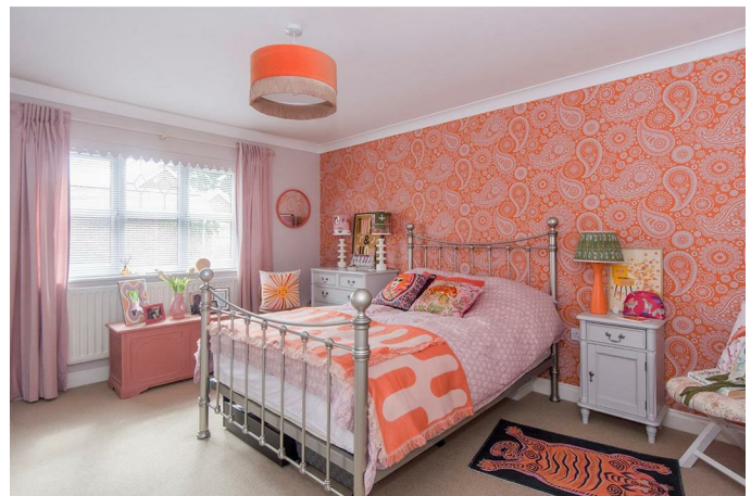
Bedroom One 14'4" x 11'8" (4.37m x 3.56m)

A double bedroom with dual aspect windows and built in wardrobes. A door opens into the en-suite.