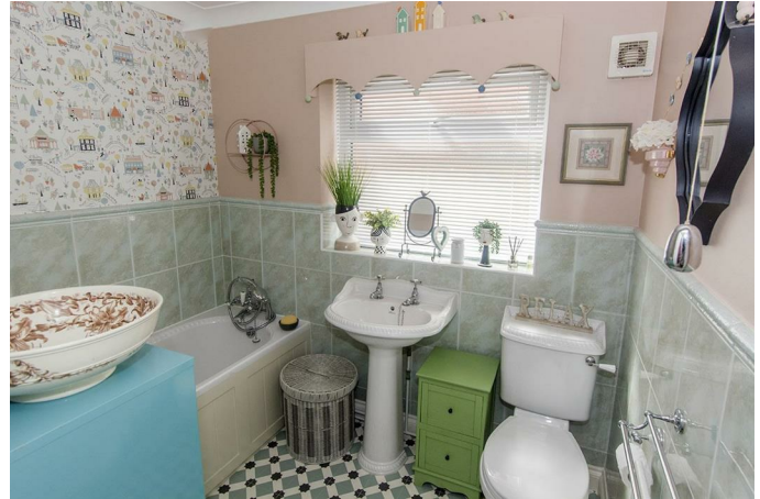
Bathroom 7'7" x 5'6" (2.31m x 1.68m)

Fitted with a high quality suite comprising, low flush WC, hand wash basin, bath with shower attachment taps, half height ceramic wall tiles and an obscure glazed window.